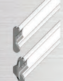
Malleable Endlocks and Windlocks