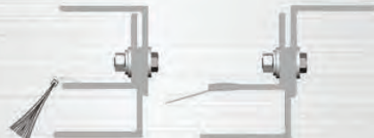
Brush & Vinyl Weather Seal Guides

Thru-Wall Chain Drive: This option is used when operation is desired from the opposite side of the wall